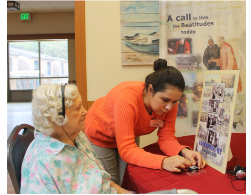
Residents and staff enjoy listening to the history of the Little Sisters!