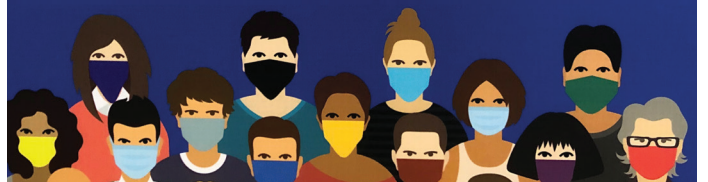
St. Martin's staff is appreciated for the continuous care of our Residents — with not one Resident contracting COVID-19 to date!