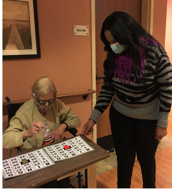
Finding the silver lining: Residents and staff enjoy an afternoon of Bingo while masked (with smiles underneath) and socially distanced.