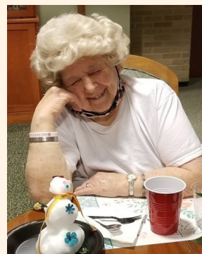
Residents in Independent Living enjoyed creating snowmen – finding the silver lining in being together while distancing from others.