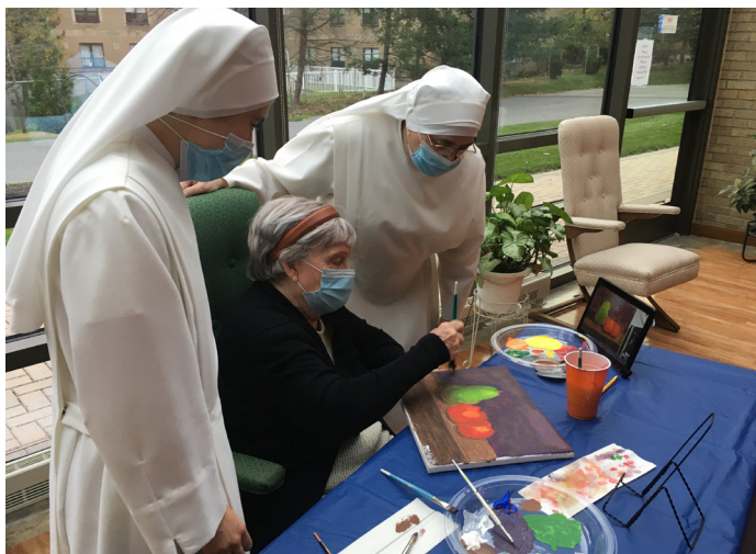
Family window visits and spending time with the Little Sisters mean so much to our Residents!